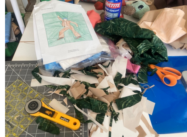
These are pictures of the mess Meredith made sewing this block – it involved sewing it onto paper and then ripping all the paper off. Lots of leftover bits and pieces of fabric and paper at the end!