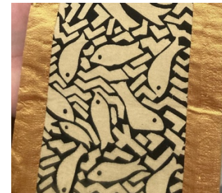
Photo of stole